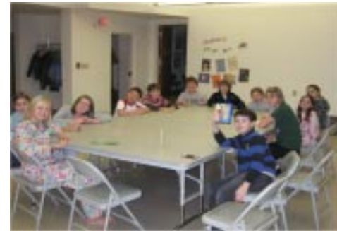
Popcorn Time! Movie!!