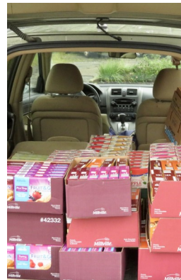
Pictured above are photos from the 2020 packing event.