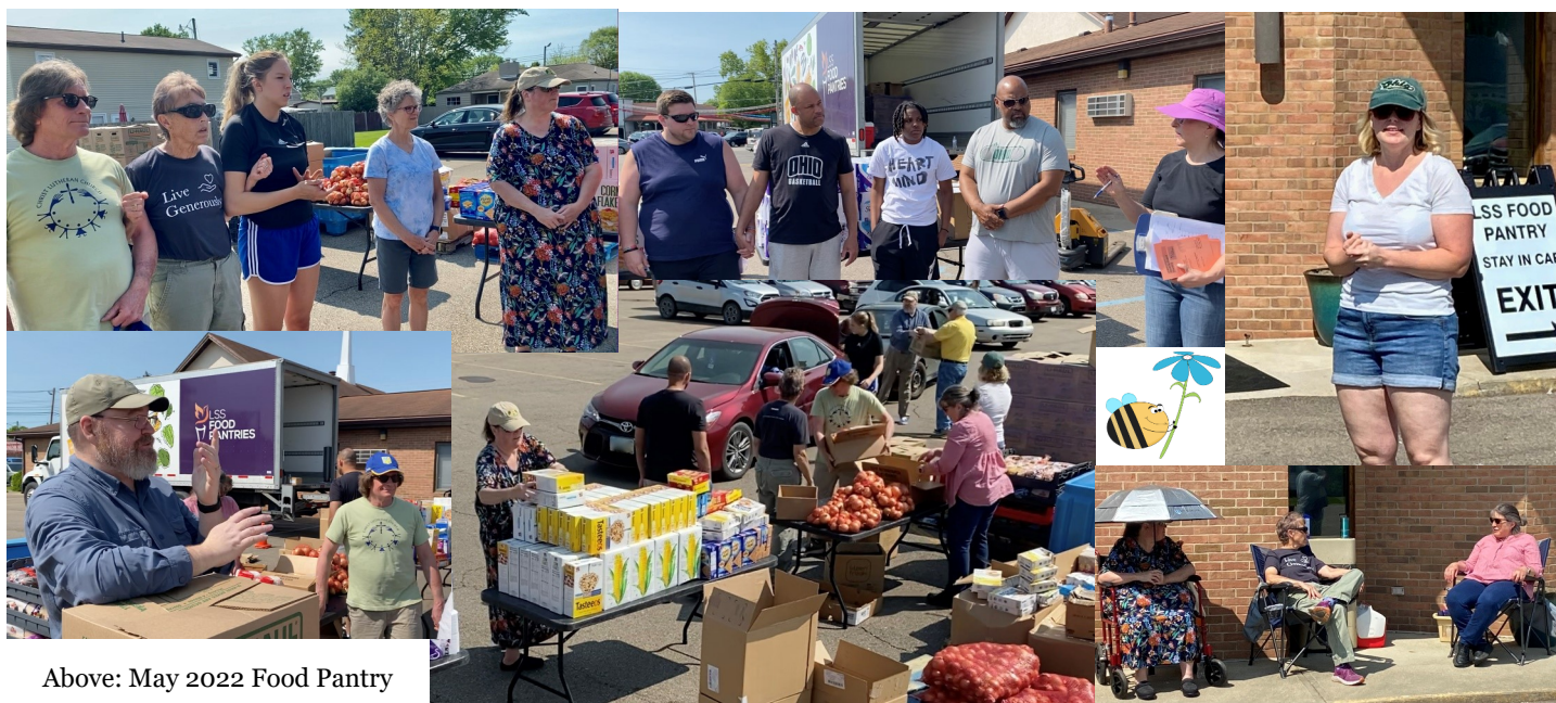
Above: May 2022 Food Pantry